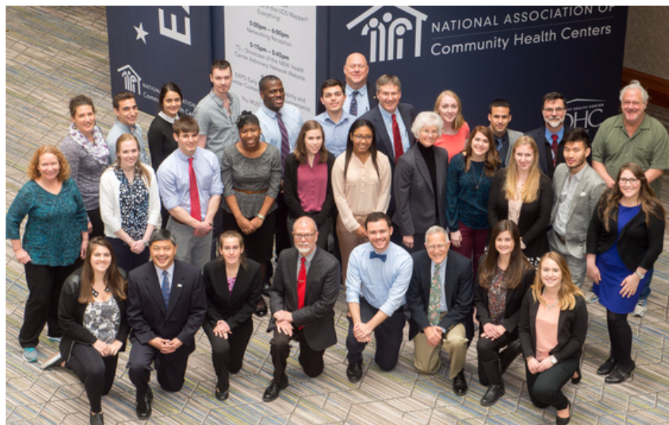
CT AHEC Urban Health Scholars, faculty and NACHC board members at the 2017 NACHC Policy & Issues Forum

Connecting students to careers, professionals to communities and communities to better health.